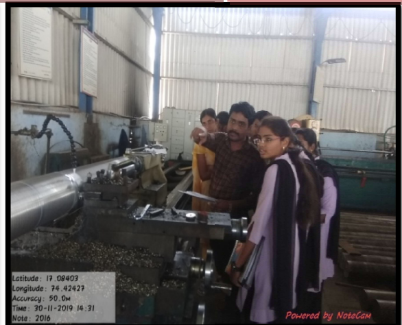
Industry Worker explaining