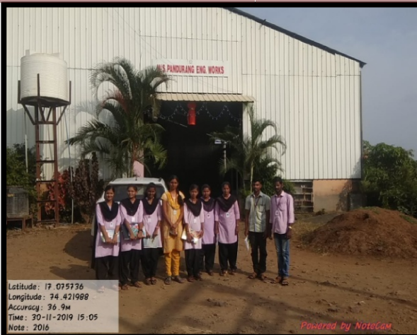
Industry Worker explaining